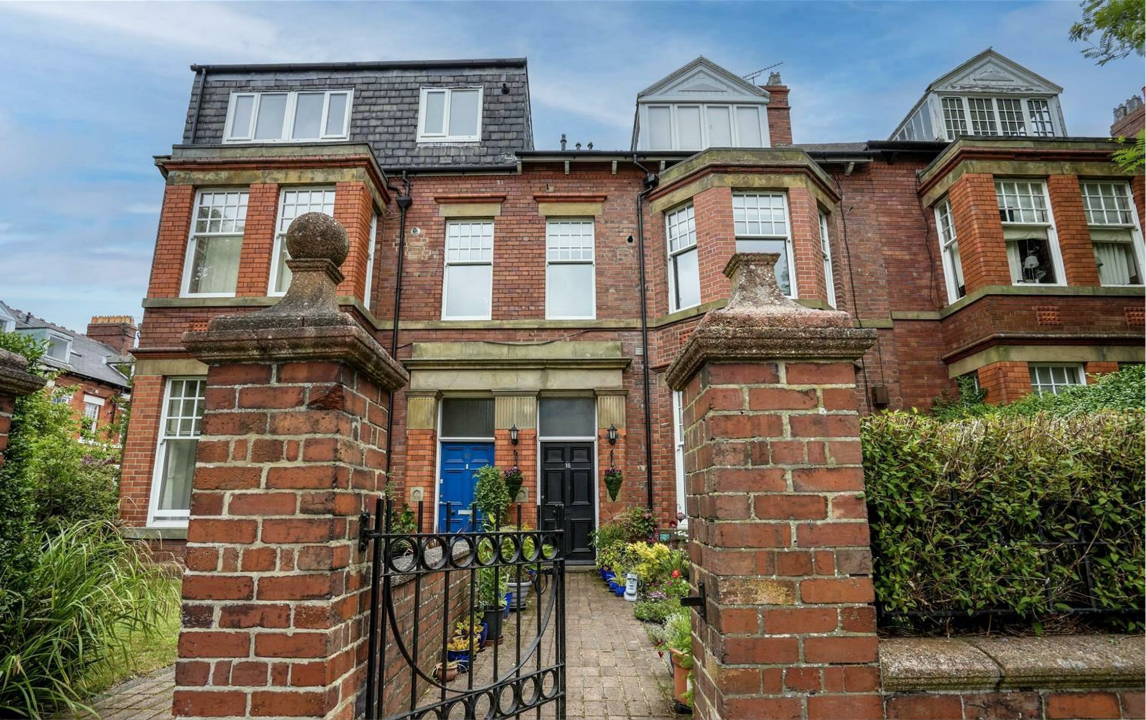
📍 Tankerville Terrace, Newcastle Upon Tyne NE2 3AH